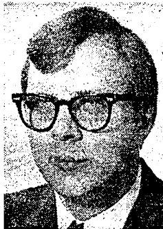
Rep. John C. Kluczynski